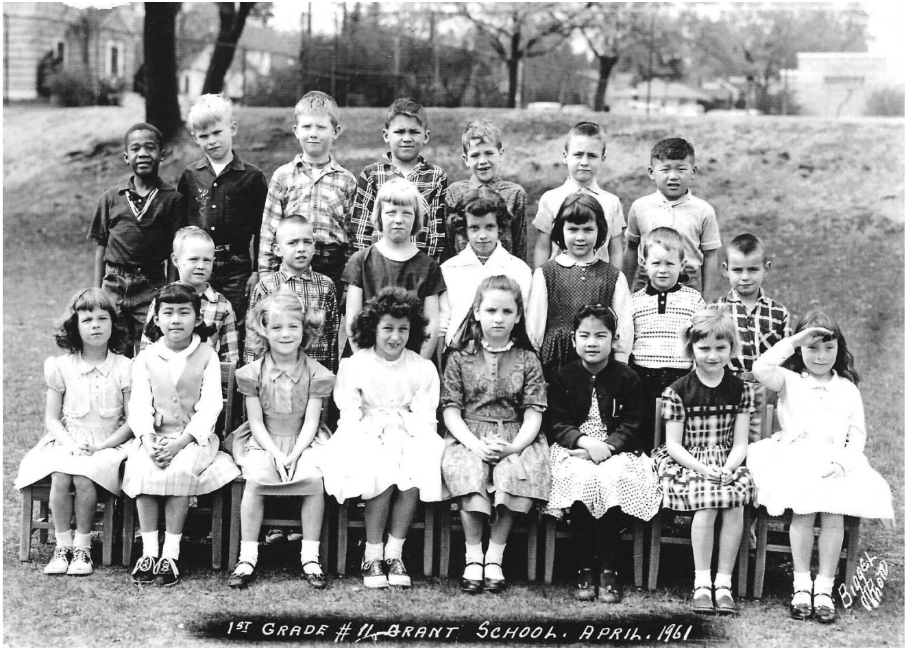
1 st grade 1961, Class of 1968